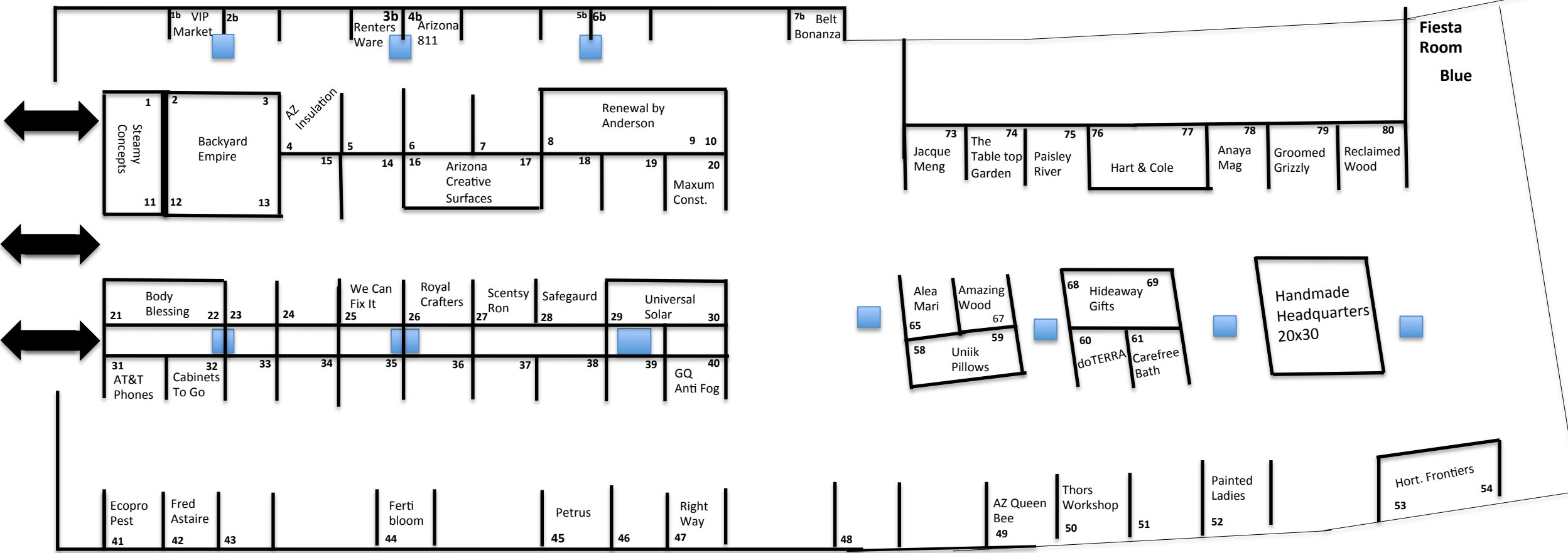
Home and Garden Vendors-Yellow

Booths located at the entrance of the Show in the ballroom and the connecting Digital Media Room. All booths are located on carpet. No canopies allowed.